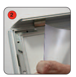
Open out the spring loaded frame sides and remove the clear protective sheets.